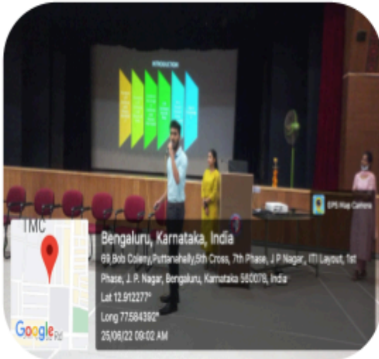
UG Student presentation - UG Research Exposition 2022