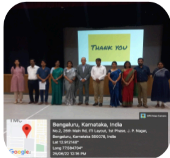
Institutional Seed Grant Awardees