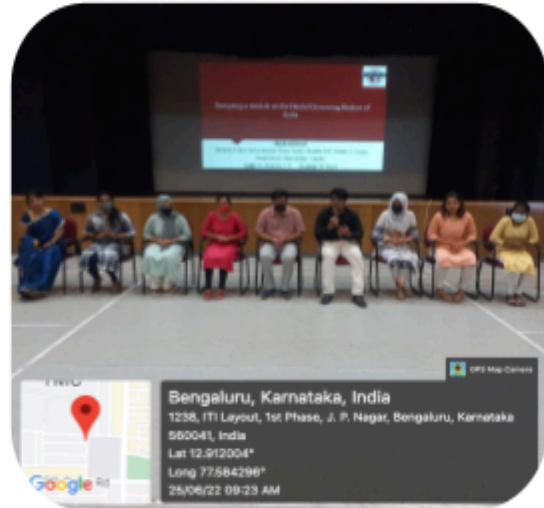
UG Student Discussion - UG Research Exposition 2022