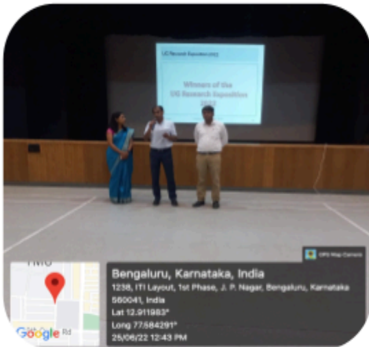
Winners of UG Research Exposition