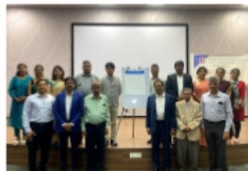
Signing of Bangalore Declaration