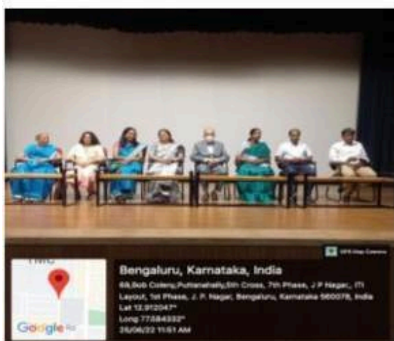
Guests for the Program