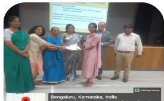
Recipients of Dr Pandurangi Memorial Public Health Research Grant